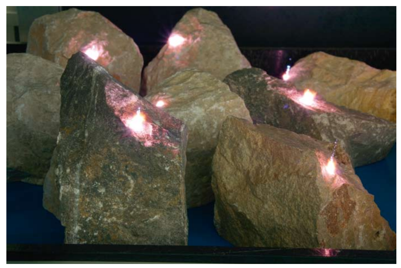
Laser-induced plasma on rock sample

As a result of this focussing, an area measuring just a few \mu m^2 on the surface is heated, the material is evaporated and ionized. This leads to the formation of laser-induced plasma, which measures only a few millimeters in size and emits radiation characteristic for the elements contained in the respective material. This radiation is broken down spectrally