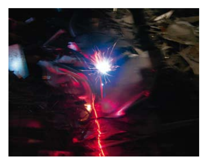
1 "Snap shot" of the analysis of slowly moving scrap steel

As a result of this focussing, an area measuring just a few \mu m^2 on the surface is heated, the material is evaporated and ionized. This leads to the formation of laser-induced plasma, which measures only a few millimeters in size and emits radiation characteristic for the elements contained in the respective material. This radiation is broken down spectrally