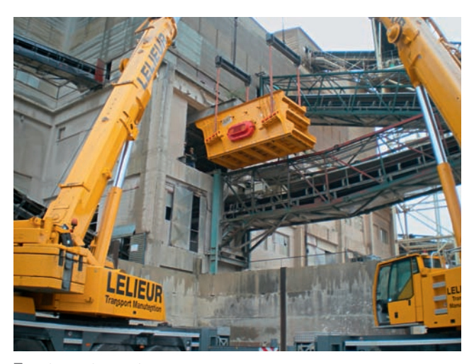
7 Lifting of one of the two screens