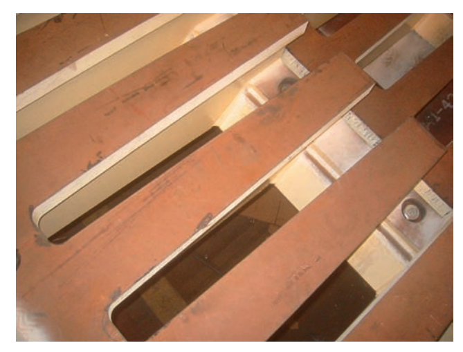
4 Steps of the grizzly made of Hardox 450 with 60 mm thickness

According to the manufacturer, the brake switch is a modest investment, which, however, can put the operator's mind at ease with regard to the vibrations transferred to the structure of a building. Its installation does indeed limit the effects of resonance in the shutdown phases and therefore the dynamic loads generated by the machine, which are always very strong during these phases. The coarse screen does not need any control. The only settings concern the mesh width with changes in the gap width in order to control separation efficiency.