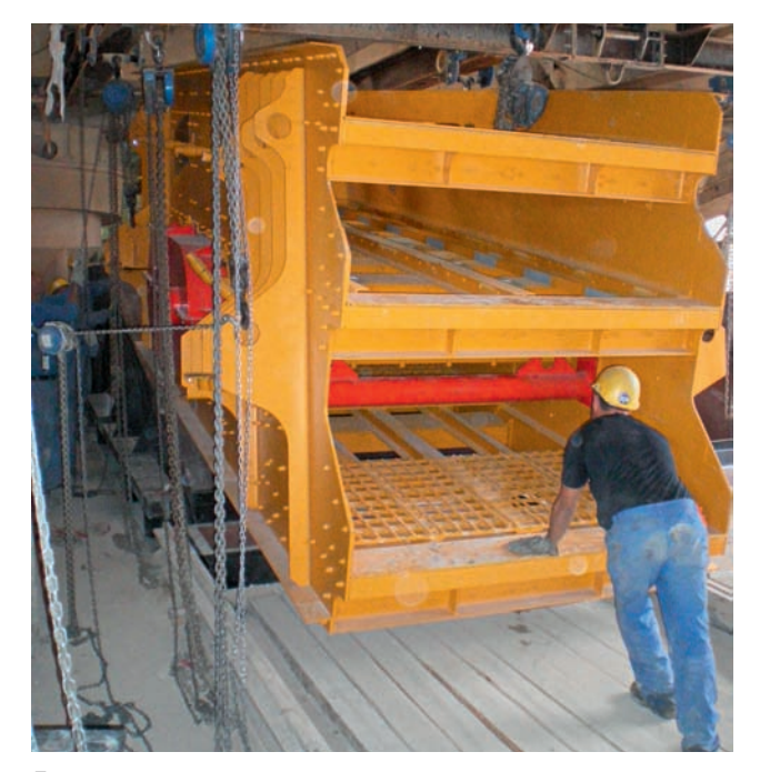
5 Installation of a screen in the same position in changed surroundings

With regard to the two wet screens, there was an urgent need for action. Following their commissioning in 1994, their mechanical condition and the condition of the springs required excessive maintenance: "The sidewalls were extremely worn and there were problems with leak-tightness around the mechanical drive, leading to the ingress of water," explained the operator. On failure of this critical equipment, the coarse screen had to be shut off as the screens were installed at the discharge outlet of the washing drums. They are fed with a 0/200 fraction from which any sand and clay have been removed. Skako Vibration installed two new identical wet screens of the type S3S in place of the old machines (Fig. 5). These big screens with circle diagram measure 2000 mm in width, 5000 mm in length and have a wall height of 2500 mm. Each weighing 14.5 t, they comprise three stages (mesh width 100x100, 80x80, 70x70) whereas the original machines had 3.5 stages. The screens consist of welded