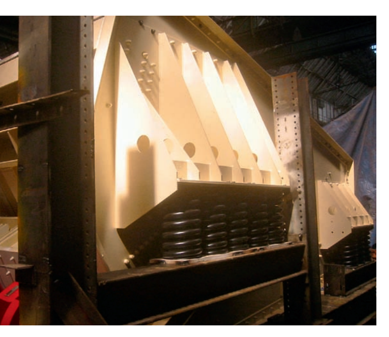
2 Support brackets for the springs of the coarse screen

erful enough to drive the coarse screen to match the limestone feed rate. The machine guarantees a throughput rate of 2000 t/h with peaks of 2500 t/h.